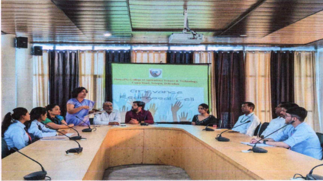
Student Grievance & Redressal Committee Meeting Dated: 23 rd August 2023