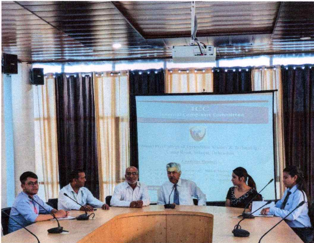
Internal Complaints Committee"(ICC) Meeting Dated 23.07.2022

Principal Doon (PG) College of Agriculture Science & Technology Selaqui, Dehradun