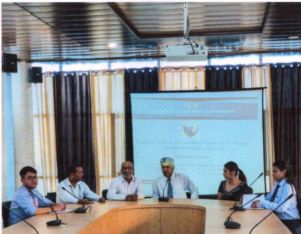
Internal Complaints Committee"(ICC) Meeting Dated 28.08.2023