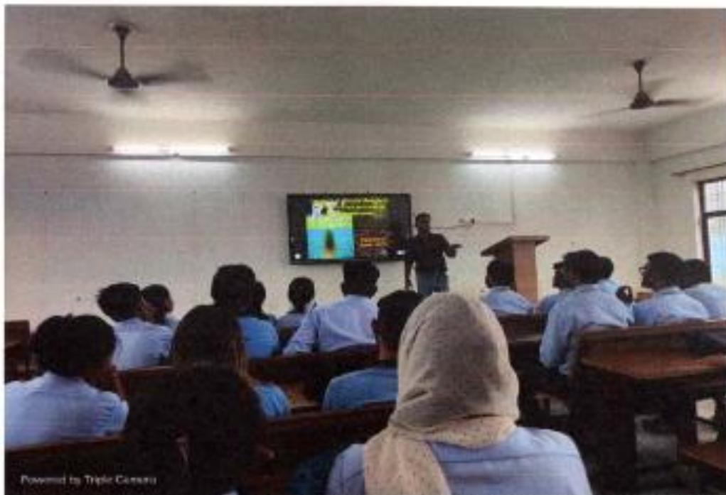
Add-on Course on "Impacts of Climate Change on Different Crops and Animal Genetic Resources"