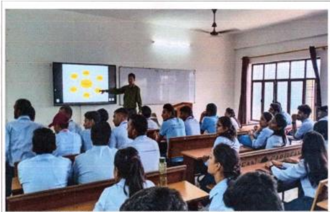
Add-on Course on "Seed Testing for Quality Assurance"