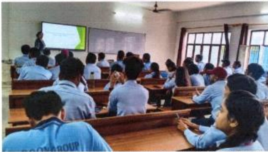
Add-on Course "Processing of Cereals, Pulses and Oilseeds"